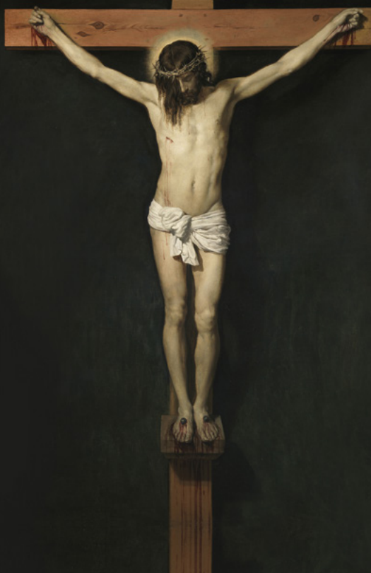
Christ Crucified by Diego Velázquez (1632)