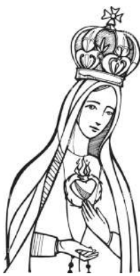
Our Lady of Fatima Feast Day May 13th.

https://catholicradionetwork.com/listen/listen-live