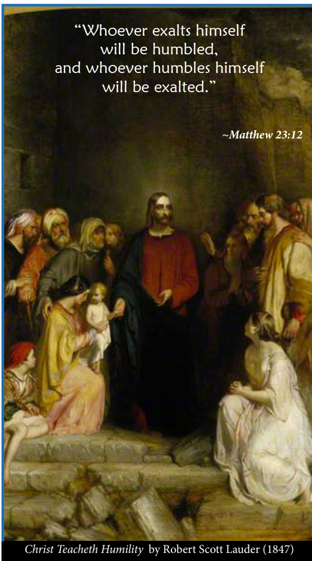
Christ Teacheth Humility by Robert Scott Lauder (1847)