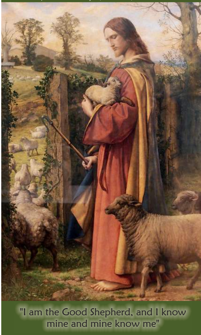
"The Good Shepherd" - William Dyce (1806-1864)

Entries will be included on a case by case basis depending on space availability and approval. Submit by 5pm Wednesdays.